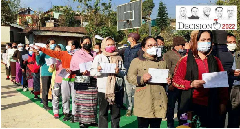
IT News Imphal, March 5:

Final phase election of the 12th Manipur Legislative Assembly was held today with the completion of the 2nd phase polling today amidst violence at some polling station, with report of a voter killed and injuring another at Karong Assembly constituency in Senapati district. Re-poll in 12 polling stations in five assembly constituencies have also been completed with high voters turnout. Average Poll percentage recorded at 3 pm was 67.77%.